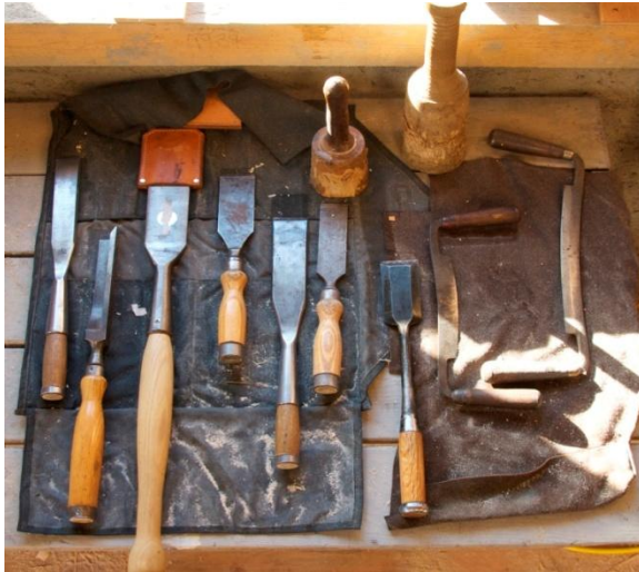
Tools of the trade

Timber frame structures exist today that have stood for 2,000 years or more, a testimony to their strength and durability. Today's timber frames are strong and durable structures, affording unique styling, exceptional strength and unique character.